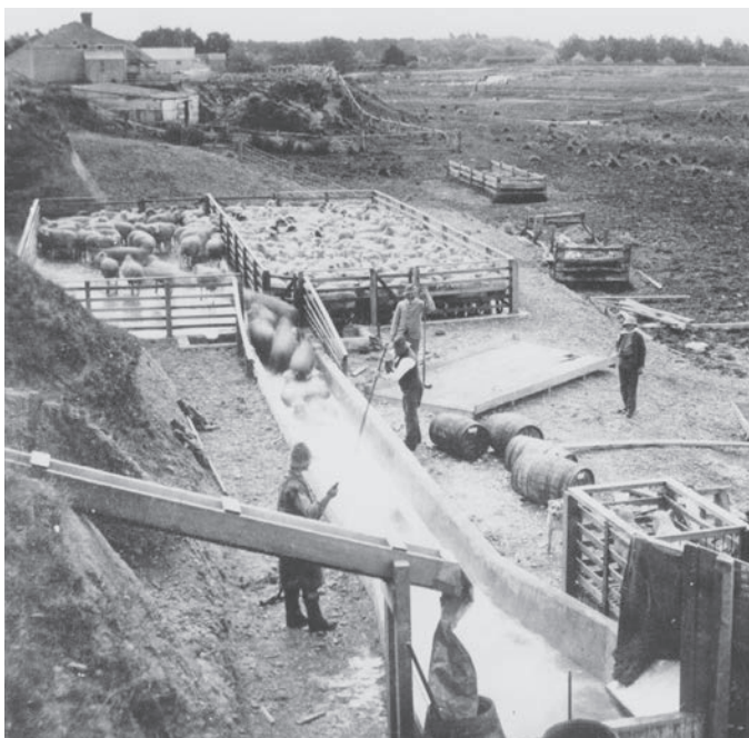
Sheep dipping (ABOVE) and gas works (TOP) are among the former land uses that have been identified as potentially hazardous.

The LLUR is an online database which we are continually updating. A property may not currently be registered on the LLUR, but this does not necessarily mean that it hasn't had a HAIL use in the past.