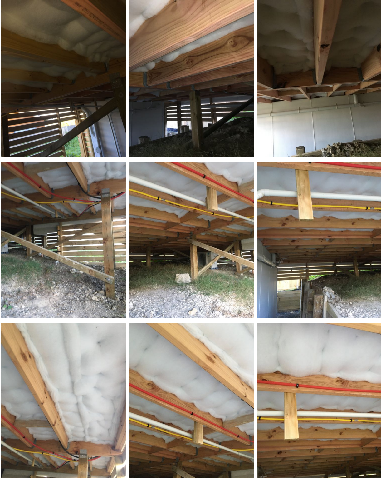
Underfloor Insulation Type 1