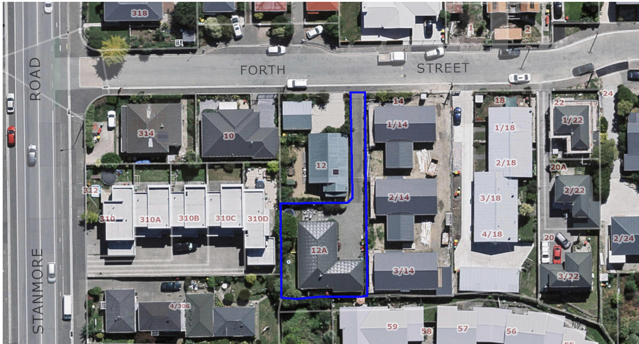
Site Location Plan Scale: 1:500